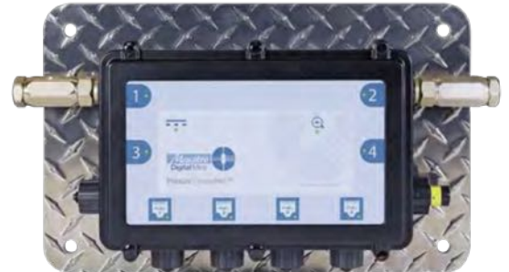
Plexus PowerNet™ delivers a high speed, low latency digital communication network.

After careful consideration, NORCAT determined that Maestro Digital Mine's Plexus PowerNet™ network was the ideal solution for their underground mine. Using a single conventional copper coaxial cable which provides power and data, Plexus PowerNet™ delivers a high speed, low latency digital communication network providing PoE+ power to IP Cameras, PoE+ lights, Wireless Access Points (WAPs) and any other IP based device. The system eliminates the need for costly fiber optic contractors and can be installed and maintained by any internal tradesperson or development miner.