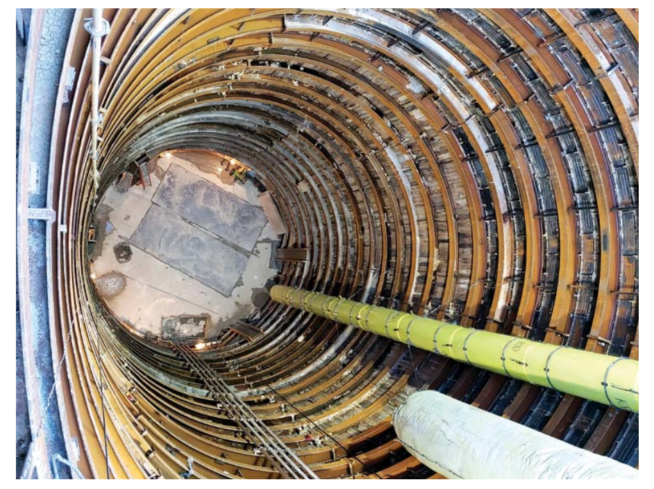
A customer in Texas hung Turnstone's flagship HardLine ducting to get more air to the face and save serious money on brackets and other hardware.

chase order, we can get our truck on the road and to the site to get people what they need fast."