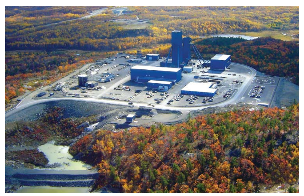
Stantec completes engineering of the underground infrastructure, including ventilation infrastructure, of Nickel Rim South, in Sudbury, Ontario.

tilation," Trapani said. "Diesel engines through combustion produce significant air contaminants as well as heat, while BEVs are driven by an electric motor so they do not produce any air contami-