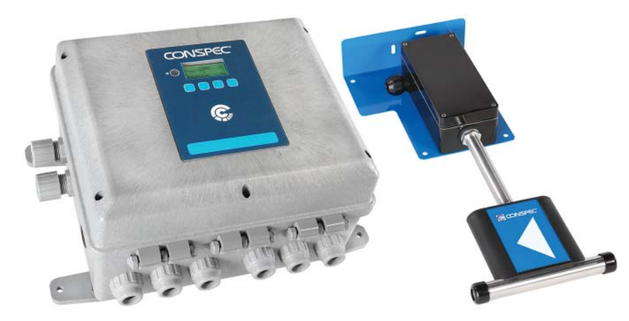
The Optio AQS from Conspec Controls can detect for up to six gases, is easy to program, and can be used for VOD.

Conspec offers the Optio monitors hardened to be explosion proof. "One of the applications is post-blast re-entry where the monitor is hung near the blast zone and after the blasts they get real-time data on the gases from the blast," Jahir said. "With the monitor and the software, they can determine when to send the crew back down to work. No more waiting and sending someone down