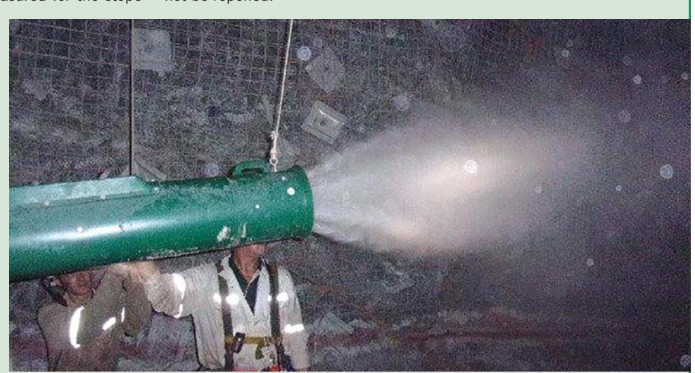
Water in the hole! The MOUSETRAP Atomizer, which is blast instigated and has a timed shutoff, broadcasts a cloud of atomized water that binds to microscopic dust particles that then rain down, cleaning the air and area.

Similar technologies fail to bring the water droplet size down enough to be truly effective. "What you're doing is effectively shooting cannonballs through the dust," he said. "You have to bring the water droplets down to near and an inclusive submicron size fraction so that the dust particle can be adsorbed and not be repelled."