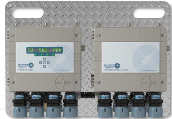
7 to 8 gas sensors DW1 option