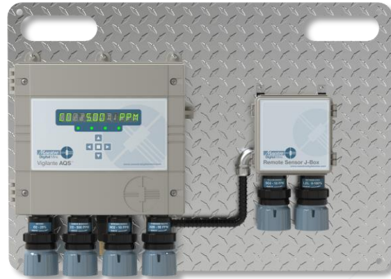
5 to 6 gas sensors DW1 option