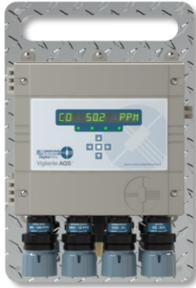
1 to 4 gas sensors IM option